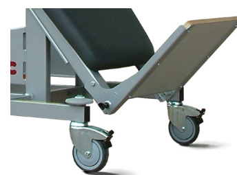
TR Classic has a wide foot plate, adjustable and lockable in three angle positions.

Standard equipment includes three safety belts for comfort and security, footboard, removable wire basket and hand operated control.