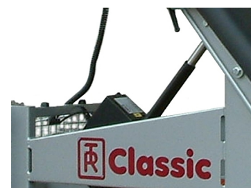
TR Classic Tilt Table is operated by an electrical actuator with battery back up for lowering in case of power failure.