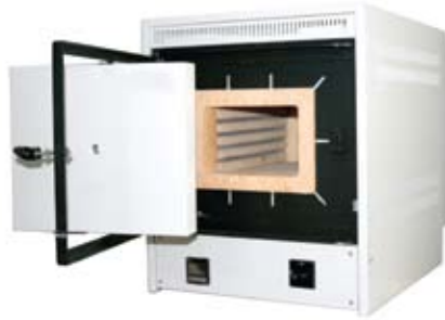
SNOL 7,2/1100 LSC01

Highly accurate laboratory electric furnaces with solid ceramic chambers. The products are designed for hardening, loosening, normalising and other thermal processing to a temperature of 1300 °C. The furnaces include ceramic bottom plates. To eliminate gasses or smoke that are released during thermal processing, ventilation hole and an exhaust system may be supplementally installed in the products. The furnaces are an excellent fit for scientific laboratories, educational institutions, medicine and industry.