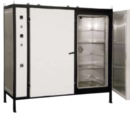
SNOL 2x240/200 LSN11