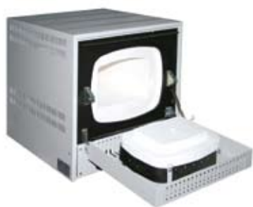
SNOL 8,2/1100 LZM01