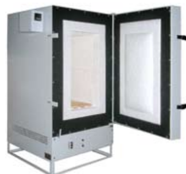
SNOL 80/1100 LSF01