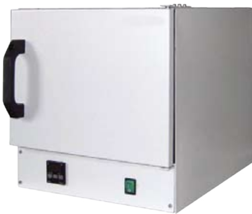
SNOL 24/200 LSP01