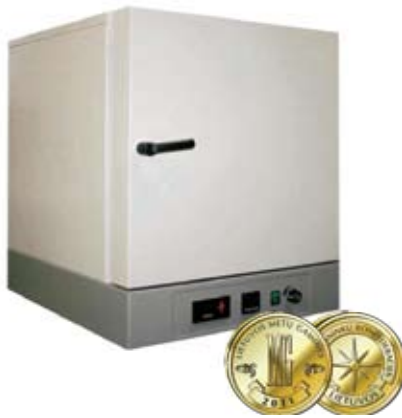
SNOL 60/300 LSN11

Laboratory ovens that are designed for the thermal processing of materials up to a temperature of 300 °C. Used for such processes as drying, heating, thermal testing and aging in an air environment. Forced air circulation allows a homogenous temperature distribution to be achieved during all processes, which ensures optimal results.