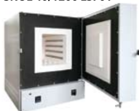
SNOL 40/1200 LSF01