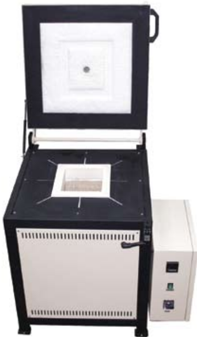
SNOL 10/900 LXC02