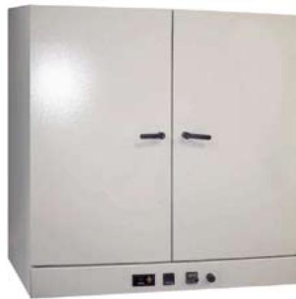
SNOL 420/300 LSN11