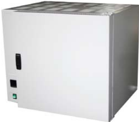
SNOL 67/350 LSN01