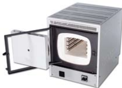
SNOL 6,7/1300 LSM01