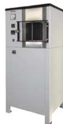
SNOL 8/1600 LSF01