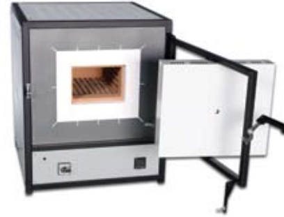
SNOL 7,2/1300 LSC01