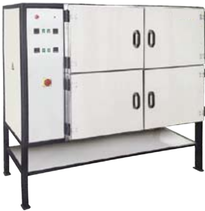
SNOL 4x80/200 LSN18

Multi-chamber low temperature electric ovens that are designed for the thermal processing, drying, preliminary heating and other thermal processes of various materials and parts up to a temperature of 200 °C. The products can be used in scientific laboratories, educational institutions, medicine and industry. Forced air circulation allows a homogenous temperature distribution to be delivered during all processes, which ensures optimal results.