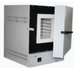
SNOL 30/1300 LSF01