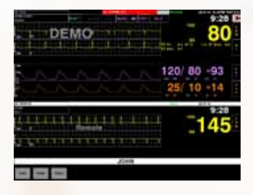
Remote Bed View and Alarm Watch