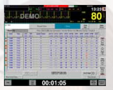
Vital signs chart with up to one minute resolution