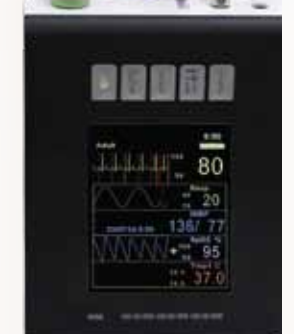
Portrait Linear Waveform View

During transport the display characteristics will change according to the position of the MX57 Module