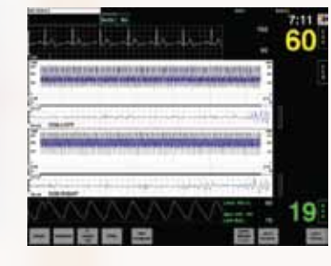
CerebraLogik aEEG Display