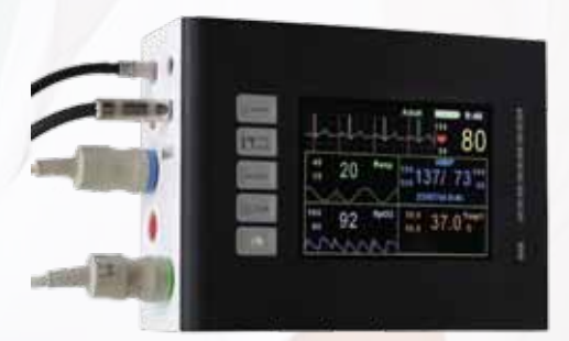
Landscape Big Number View