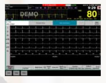
Full Disclosure of ECG waveforms 10 second display