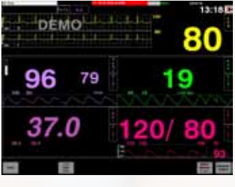
Very Big Number display