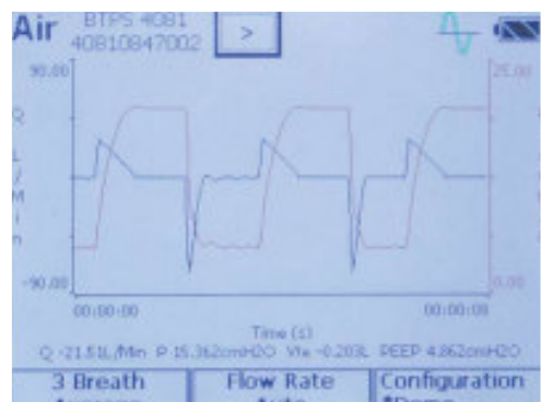
Graph up to 2 test parameters