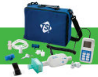
4070 High-flow test system with 4073 Oxygen sensor kit (sold separately)

TSI and the TSI Logo are registered trademarks of TSI Incorporated.