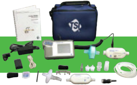
4080 High-flow test system with 4082 Low-flow kit (sold separately)