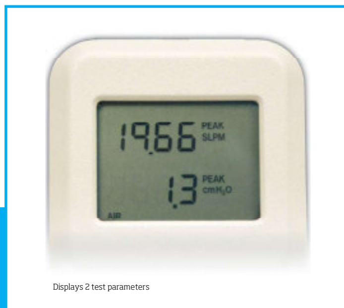
Displays 2 test parameters