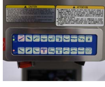
Back lit back-up controls for emergency situations