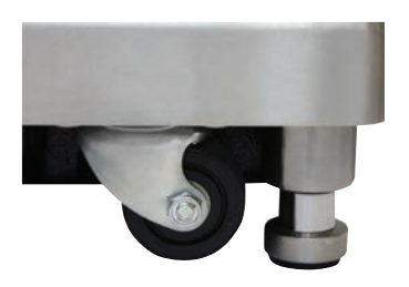
Self-leveling brakes for stability on uneven floors