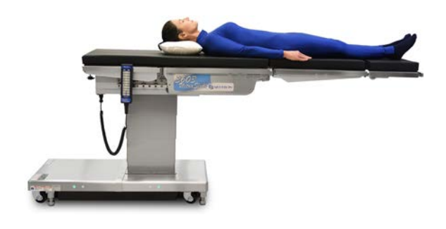
Lower Body Imaging