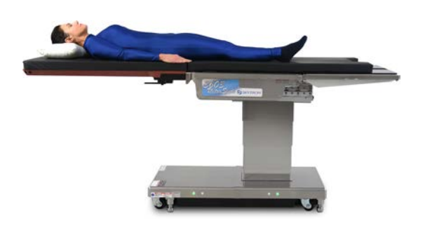
Upper Body Imaging with 40" Carbon Fiber Extension