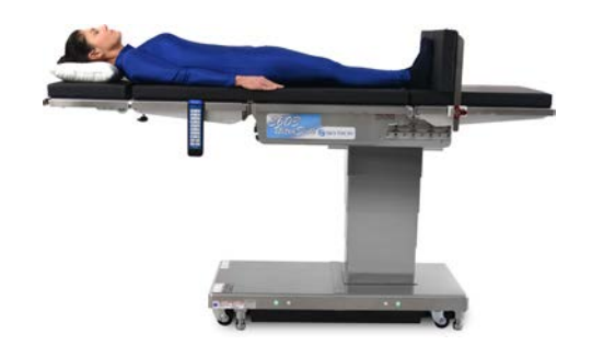
Upper Body Imaging