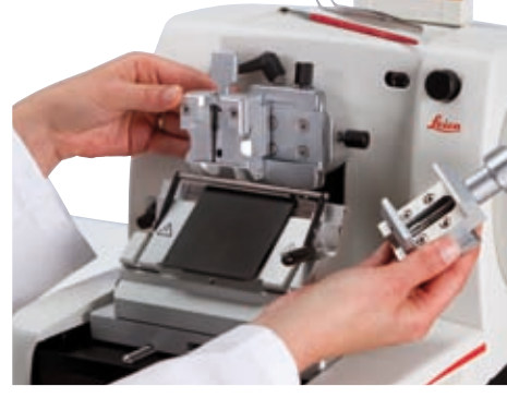
Quick-exchange specimen clamp