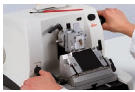
Two trim steps for efficient operation