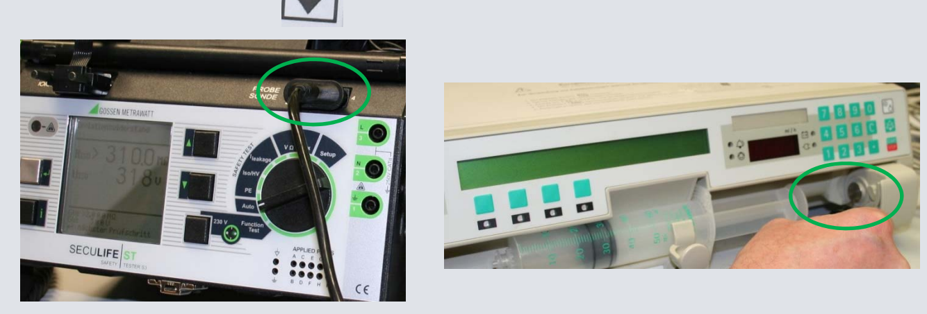
Connection DUT with the SECULIFE ST and connection on the DUT (in this case: infusion pump)

B=Body, BF= Body Float, CF = Cardiac Float