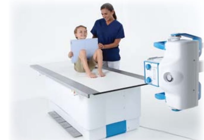
All equipment, other than the CXDI Wireless Series Detectors, are shown for illustration purposes only

Integrate the Canon lightweight and dose friendly wireless detectors into your existing X-ray systems. The CXDI-70C Wireless and CXDI-80C Wireless Detectors easily fit into most existing Bucky trays. The CXDI-80C Wireless Detector can be ideal for the Neonatal Intensive Care Unit (NICU) beds, with its pediatric friendly exclusive imaging size. Four (4) detectors can be used concurrently with simple and efficient infrared (IR) check-in and patient data can be transferred seamlessly through Wi-Fi Protected Access II (WPA2<sup>TM</sup>) with AES ecryption.