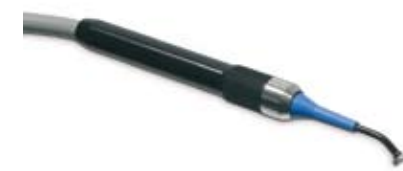
133004 Cryo probe for retina, "T" shaped