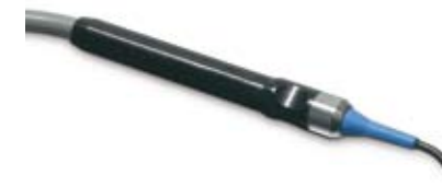
133001 Cryo probe for cataract