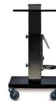
183001 Trolley for Cryoline with cylinder holder