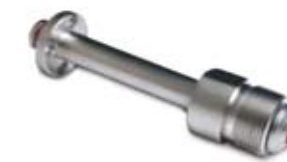
132010 N 2 O cylinder adapter (French standard)