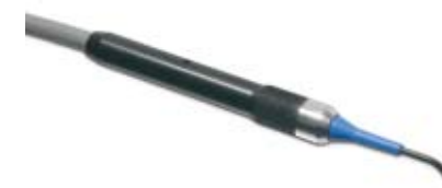
133003 Cryo probe for retina, spatula