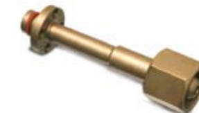
132006 CO 2 cylinder adapter (Chinese standard)