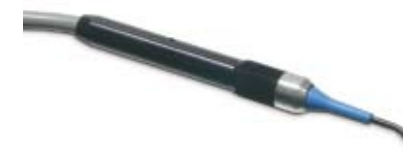
133002 Cryo probe for retina, ball