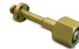
132009 CO 2 cylinder adapter (ISO5145 standard)