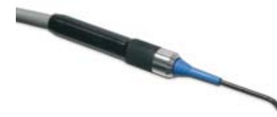
133005 Cryo probe for retina, "Bonnet"