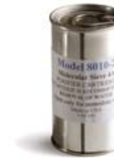
132005 Spare cartridge for gas filter