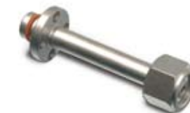
132008 N 2 O cylinder adapter (ISO5145 standard)