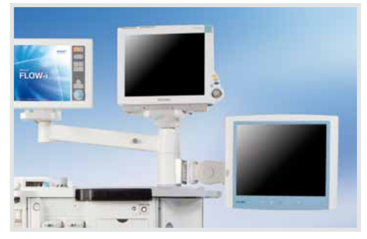
The open architecture of FLOW-i supports the patient monitor and data management system of choice (not included).

Customizable and Upgradable: Open architecture allows for adding the patient monitor and data management system of choice. The position of the control panel and patient monitor may be exchanged according to clinical needs and preferences. The open-platform design helps avoid the need for costly equipment replacement since FLOW-i allows future software and hardware advances to be easily and cost-effectively integrated.