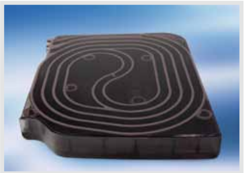
The FLOW-i VOLUME REFLECTOR.