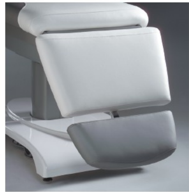
Foot rest adjustment