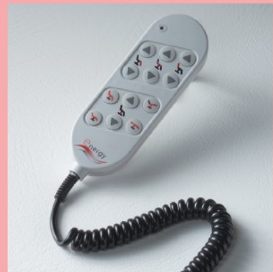
Multifunctional remote control