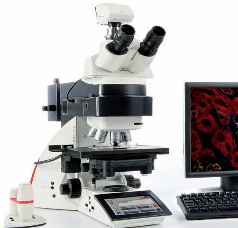
The automated research microscope Leica DM6000 B with the digital camera Leica DFC345 FX.