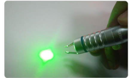
532nm Green Laser

Surgery DEEP Tissue Therapy Veterinary Beauty (3W/5W/8W-532nm Green Laser)