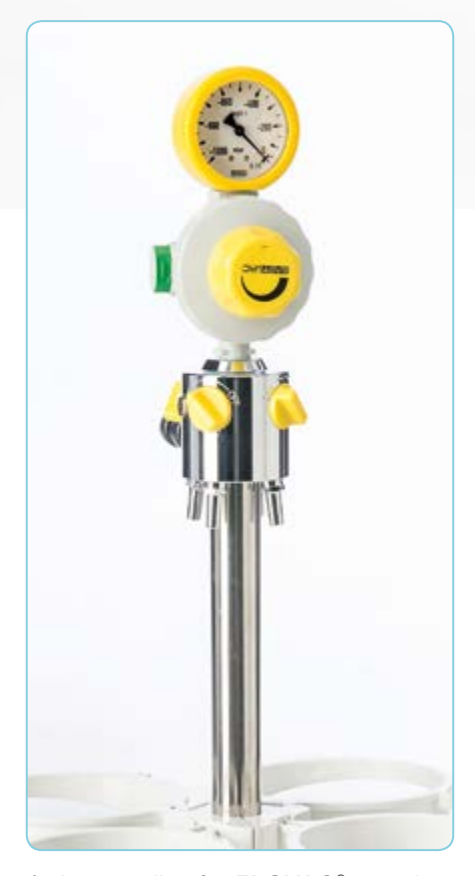
4-places trolley for FLOVAC ® container with 4 support rings, ON-OFF taps and vacuum regulator.