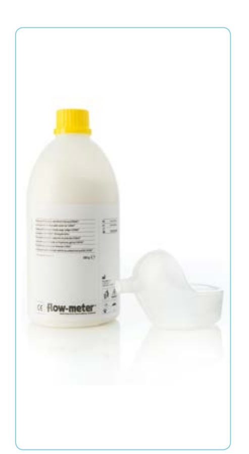
Gelling powder in 500 g. bottles with funnel/doser. 10 bottles/box