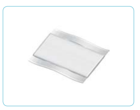
Special gelling powder bag for all sizes of CANISTER FLOVAC ^{\circ} .