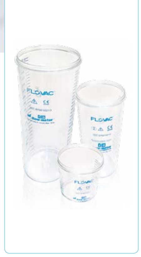
Reusable support jars (LINER version) 1.0 L, 2.0 L, 3.0 L in polycarbonate, autoclavable.