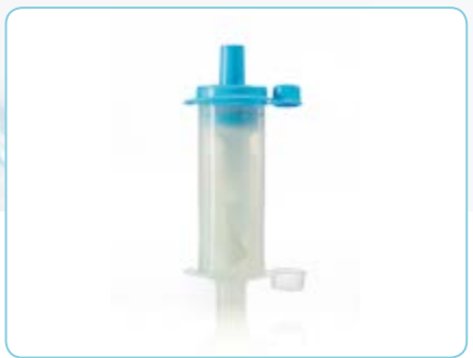
Specimen container. 10 pieces/box