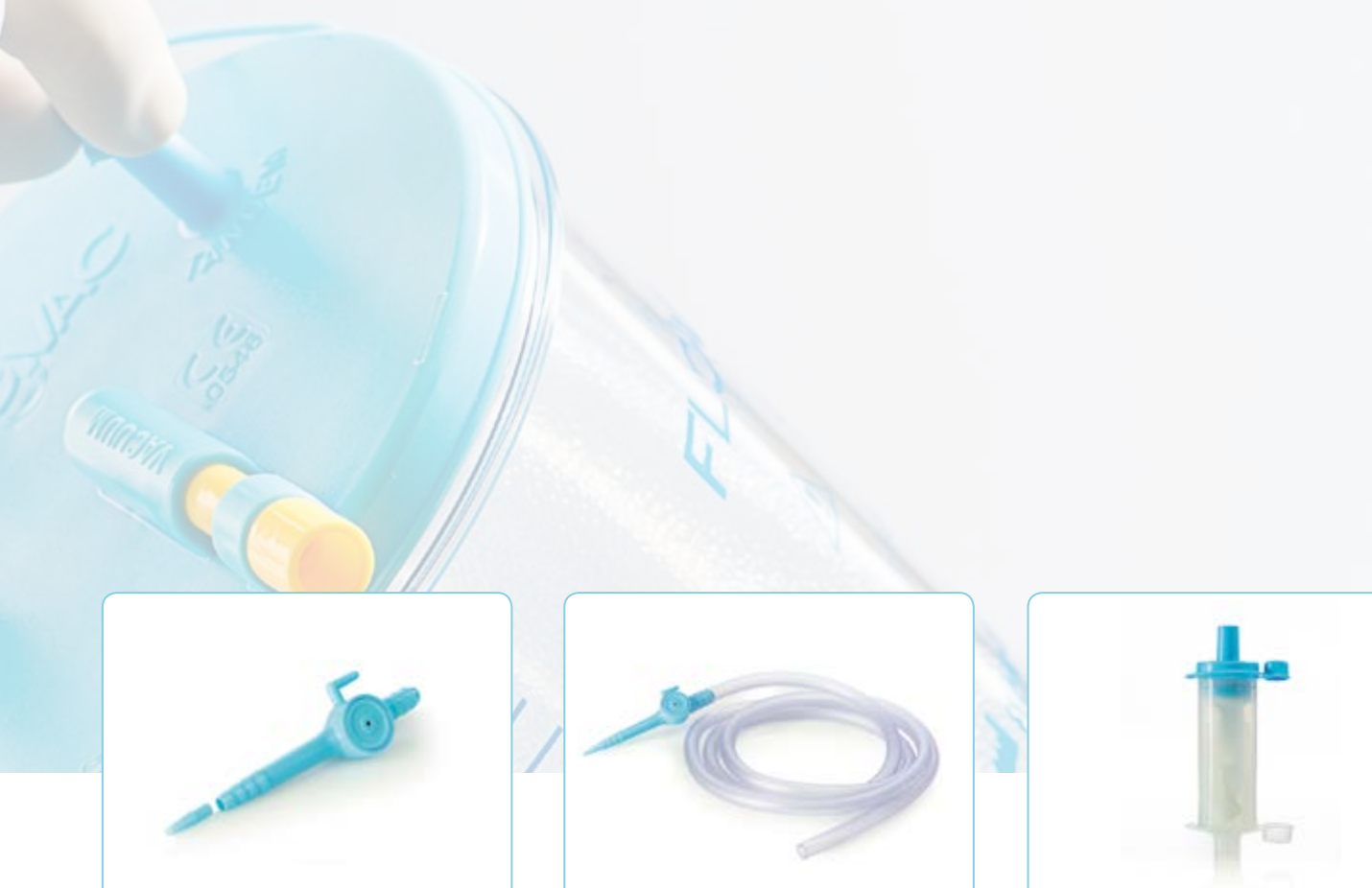
Disposable VACUUM breaker. 50 pieces/box