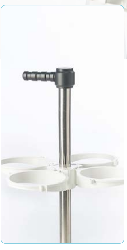
4-places trolley for FLOVAC® container with 4 support rings, and handle.