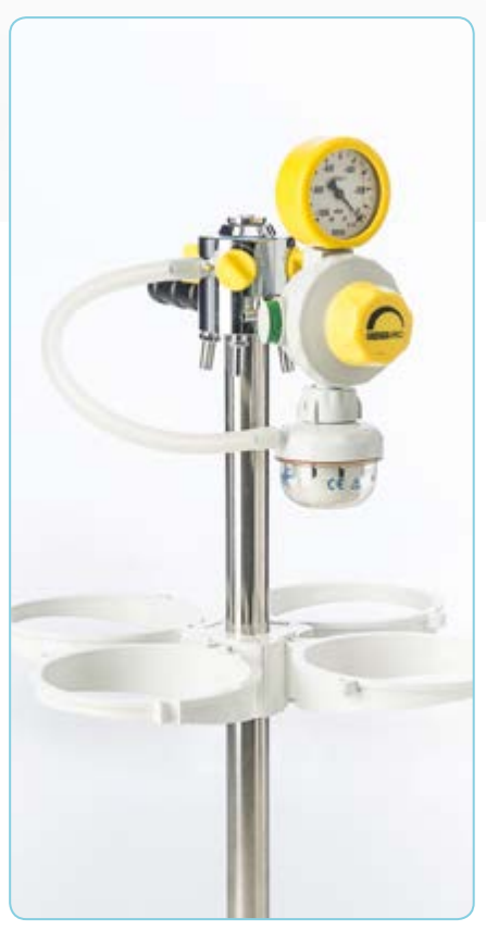
4-places trolley for FLOVAC® container with 4 support rings, ON-OFF taps and side fitting vacuum regulator with safety jar.