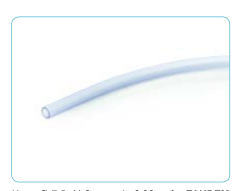
Hose Ø 7.5x11.2 mm - L=0.38 m for TANDEM connection.