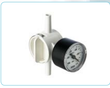
ON-OFF tap with or without control vacuum gauge, for fitting {\bf FLOVAC}^{\otimes} container support ring.