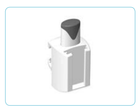
Bracket for 30x10 mm rail in technopolymer with 25x5 mm slide.