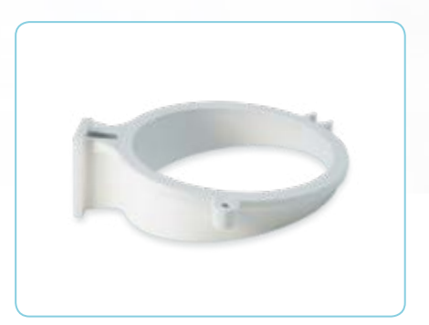
Support ring for FLOVAC® container with 25x5 mm hook (standard) with 30x5 mm hook with 41x4 mm hook with 45x5 mm hook.