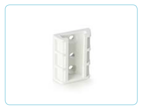
25x5 mm slide wall plate (standard) 30x5 mm slide wall plate 45x5 mm slide wall plate.