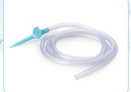
Hose Ø 7.5x11.2 mm - L=1.8 m with disposable VACUUM breaker. 100 pieces/box