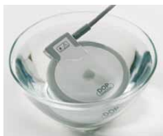
Waterproof transducers with 9 elements