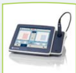
touchTymp device with printer