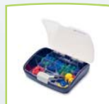
Ear tip kit